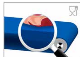
No biofilm, no contamination

✓ Bacterial growth inhibited ✓ No migration (1) ✓ No contamination from the belt