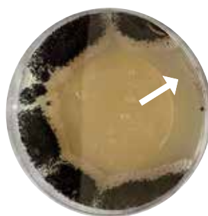
Competitors antimicrobial belts WITH BIOCIDES

✓ Bacterial growth inhibited ✗ Migration of biocides ✗ Loss of antimicrobial efficacy due to biocides migration