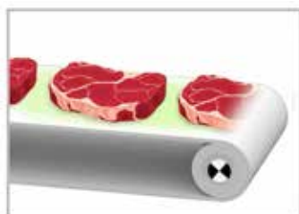
Biofilm formation on belt

✗ Bacterial growth on the belt's surface