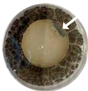
Standard TPU belt

Tests performed by external independent Laboratory.