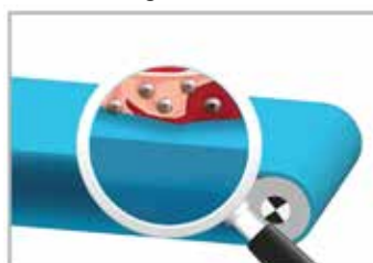
Food contamination & reduced antimicrobial effect with time

✓ Bacterial growth inhibited ✗ Migration of biocides ✗ Loss of antimicrobial efficacy due to biocides migration